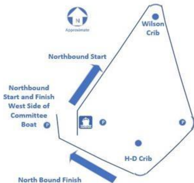
Figure 3: North route - B