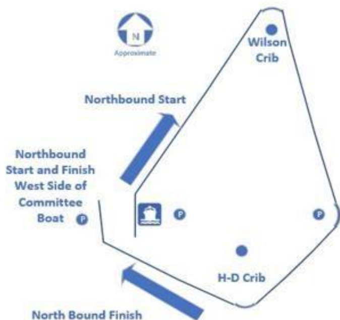
Figure 3: North route - B