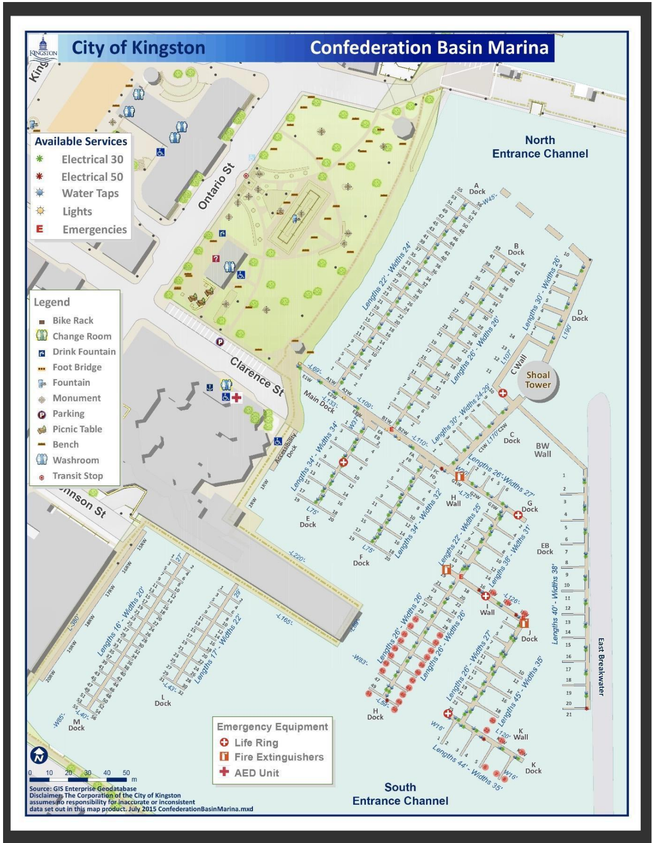
Diagram 2 Confederation Basin Marina Map