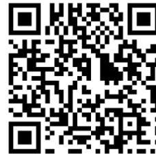
Getting Back from the HOOK