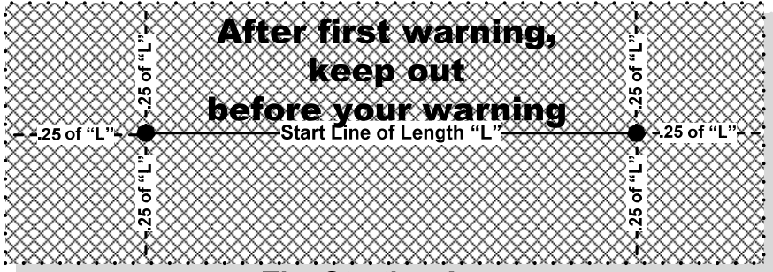
The Starting Area

After the first warning signal for a race and prior to her warning signal, a sailboat shall keep clear of the starting area that extends one-quarter of the length of the starting line ahead of and behind the starting line. It shall also extend one-quarter of the length of the starting line past either end of the starting line